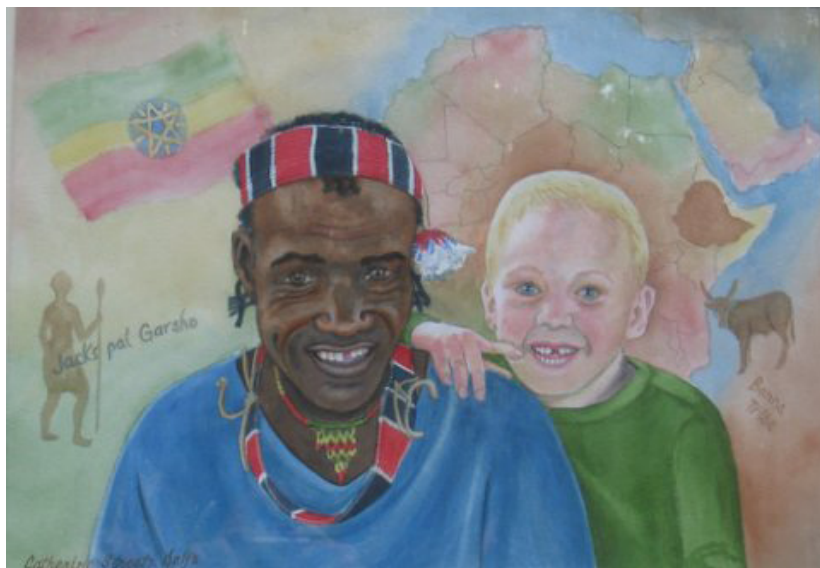
2nd Place Common Humanity Watercolor by Catherine Street Delfs