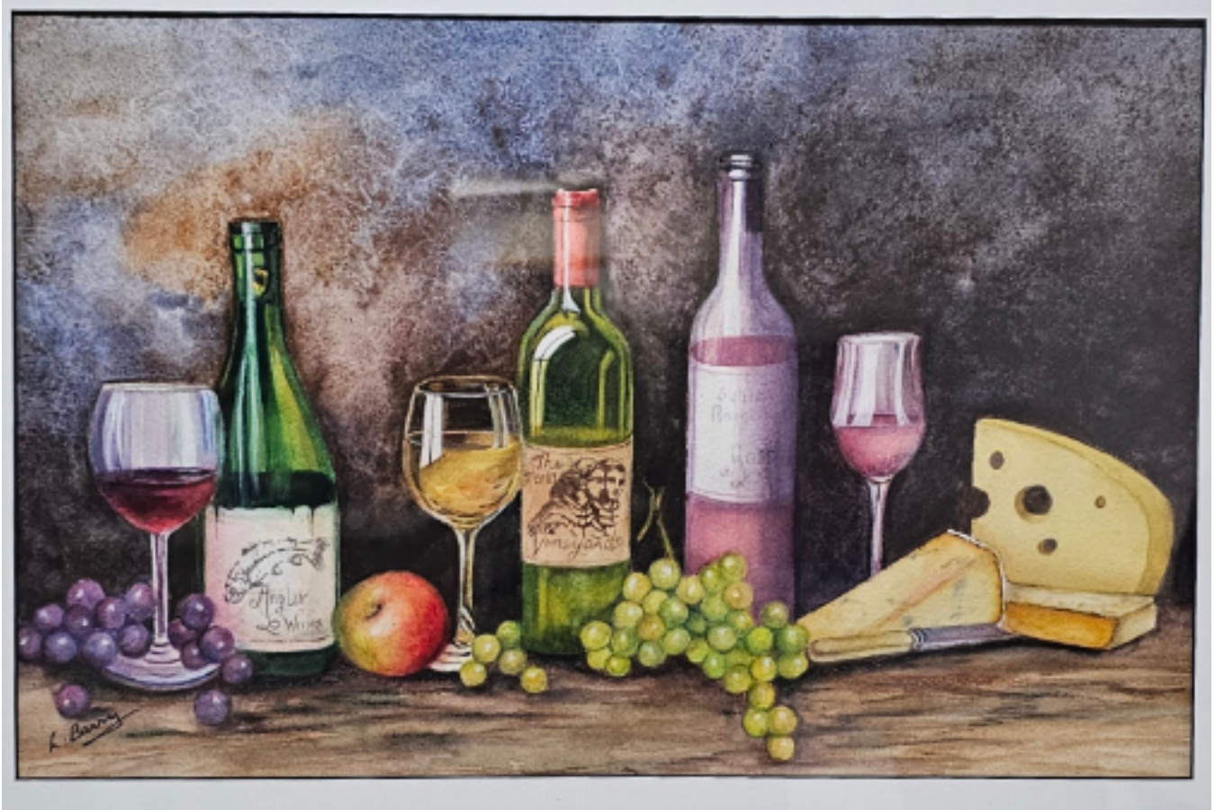
2 nd Place Wine a Little by Lorraine Barry