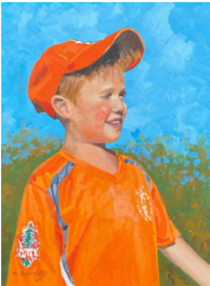
3 rd Place The Ball Player Oil by Bill Ramroth