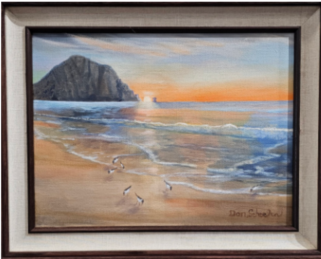
2 nd Place Morro by Don Schoelen